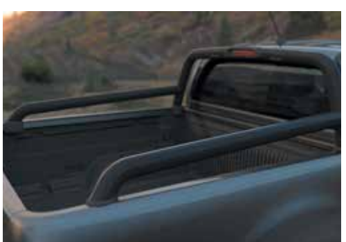
Black Extended Sports Bar