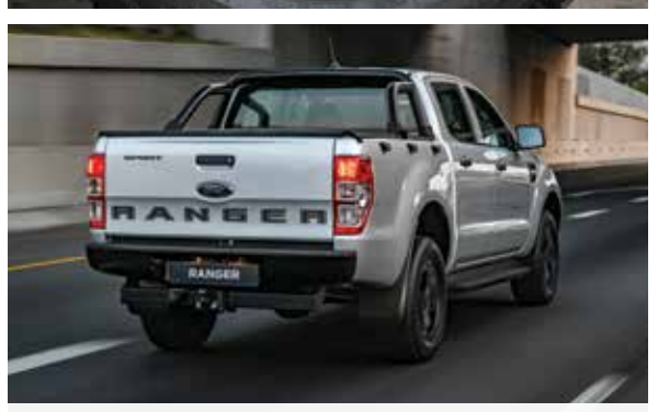
Ranger Decal on Tailgate