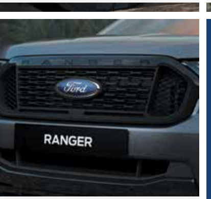
Black Mesh Grille