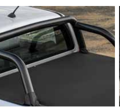
Black Sports Bar