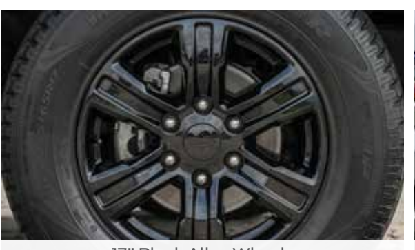
17" Black Alloy Wheels