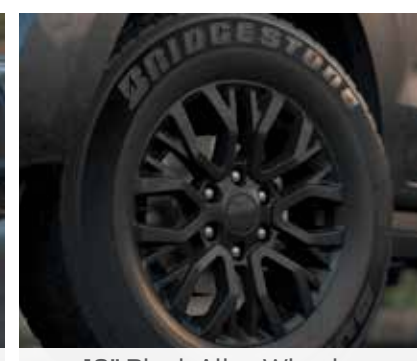
18" Black Alloy Wheels