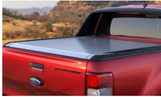
Power Roller Shutter