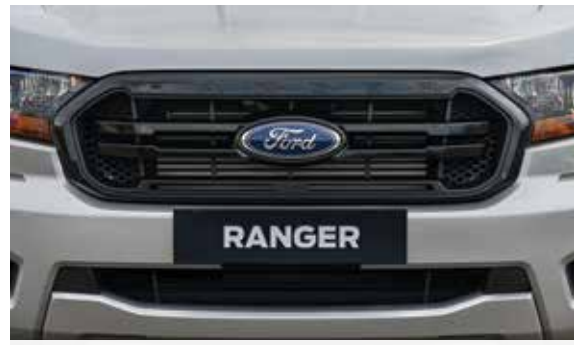
Black Gloss Grille