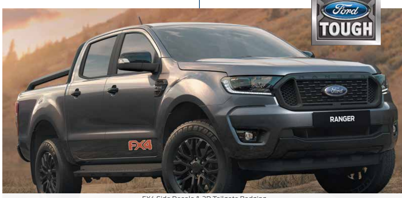
FX4 Side Decals & 3D Tailgate Badging