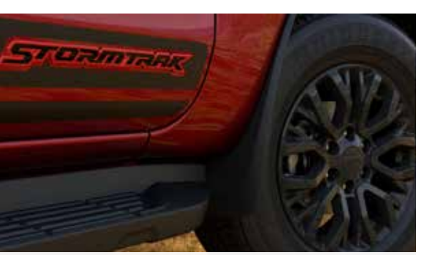
Stormtrak decal & Black Unique 18" Alloy wheel