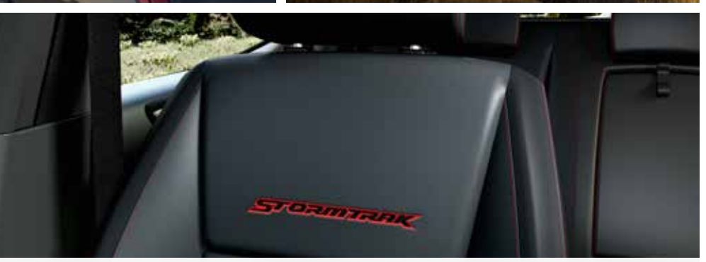
Premium leather embossed seat material with red stitching & Stormtrak logo