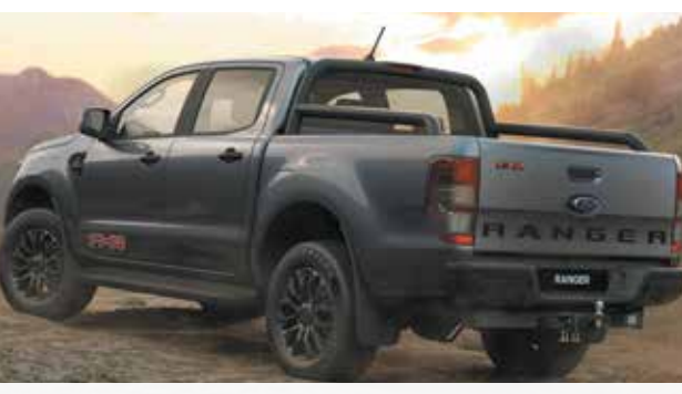
Black Painted Handles and Mirrors

available in the following colours: Sea Grey (Metallic*) Frozen White Race Red