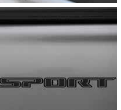
Small Sport Decal