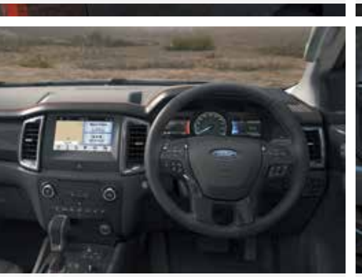
Unique leather trimmed FX4 seats