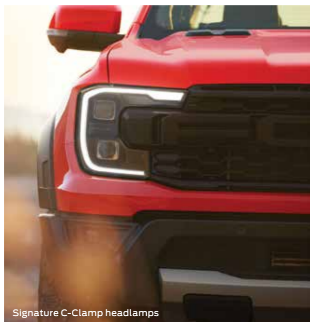
Signature C-Clamp headlamps