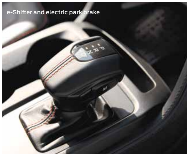
e-Shifter and electric park brake