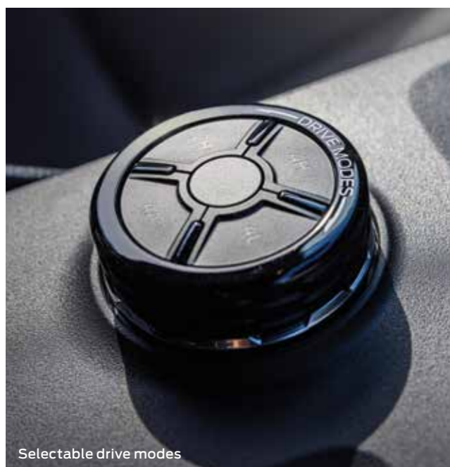
Selectable drive modes

Mated to a performance tuned 10-speed automatic transmission with a race-bred anti-lag system available in Baja mode improving acceleration out of corners.