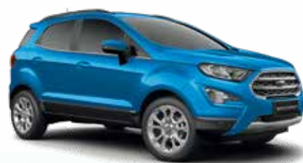
Desert Island Blue*