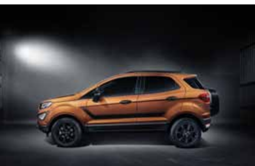
Black roof rails • Side decals