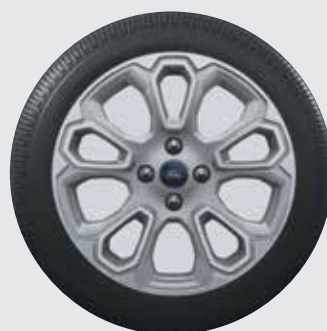
17" Alloy wheel 205/50 R17 Standard on Titanium