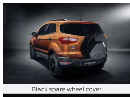
Black spare wheel cover

The ECOSPORT BLACK is available in the following colours: