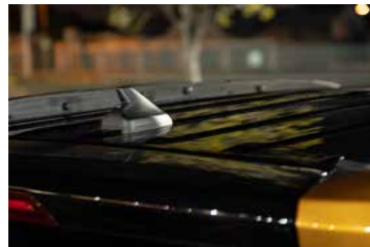
Black painted roof

The ECOSPORT ACTIVE is available in the following colours: