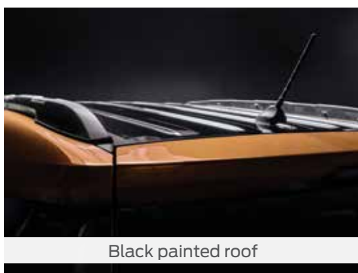
Black painted roof