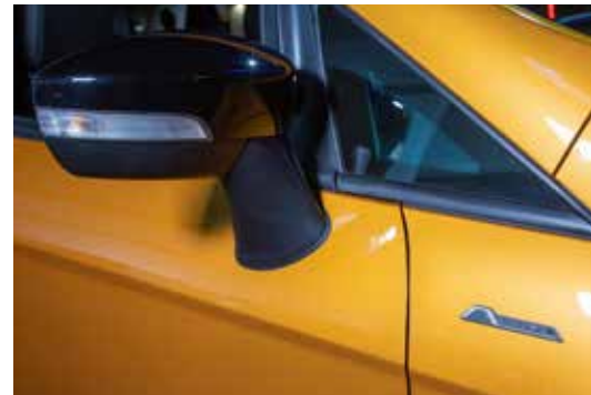
Black exterior mirrors and Active badge