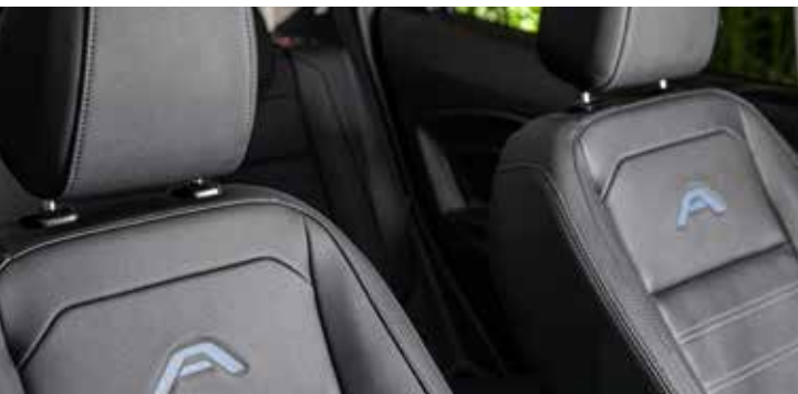
Branded leather seats