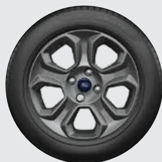
16" Alloy wheel 205/60 R16 Standard on Trend