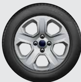
16" Steel wheel with styled cover 205/60 R16 Standard on Ambiente