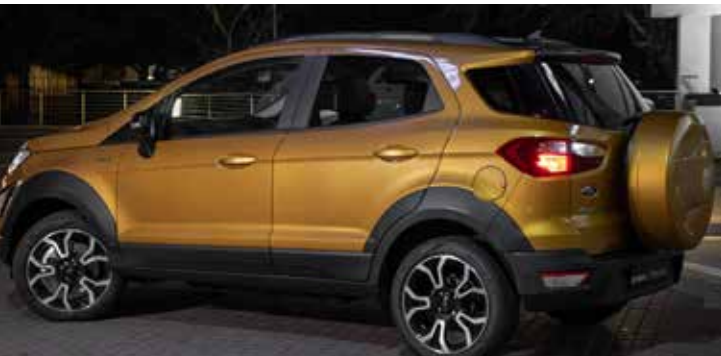
Black fender cladding