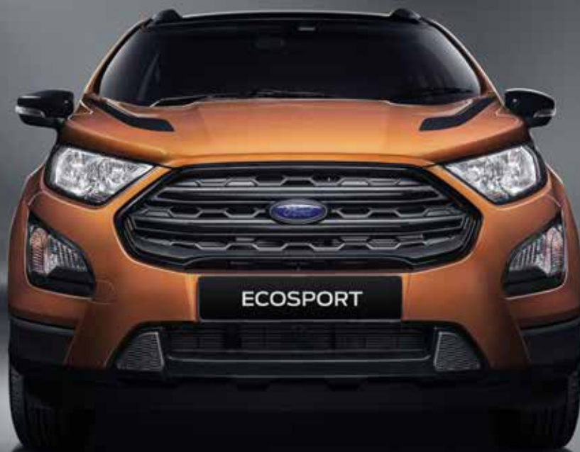
Black Hood decals • Black grill

Gear up for more fun, more style, and more thrill with the New Ford EcoSport Black