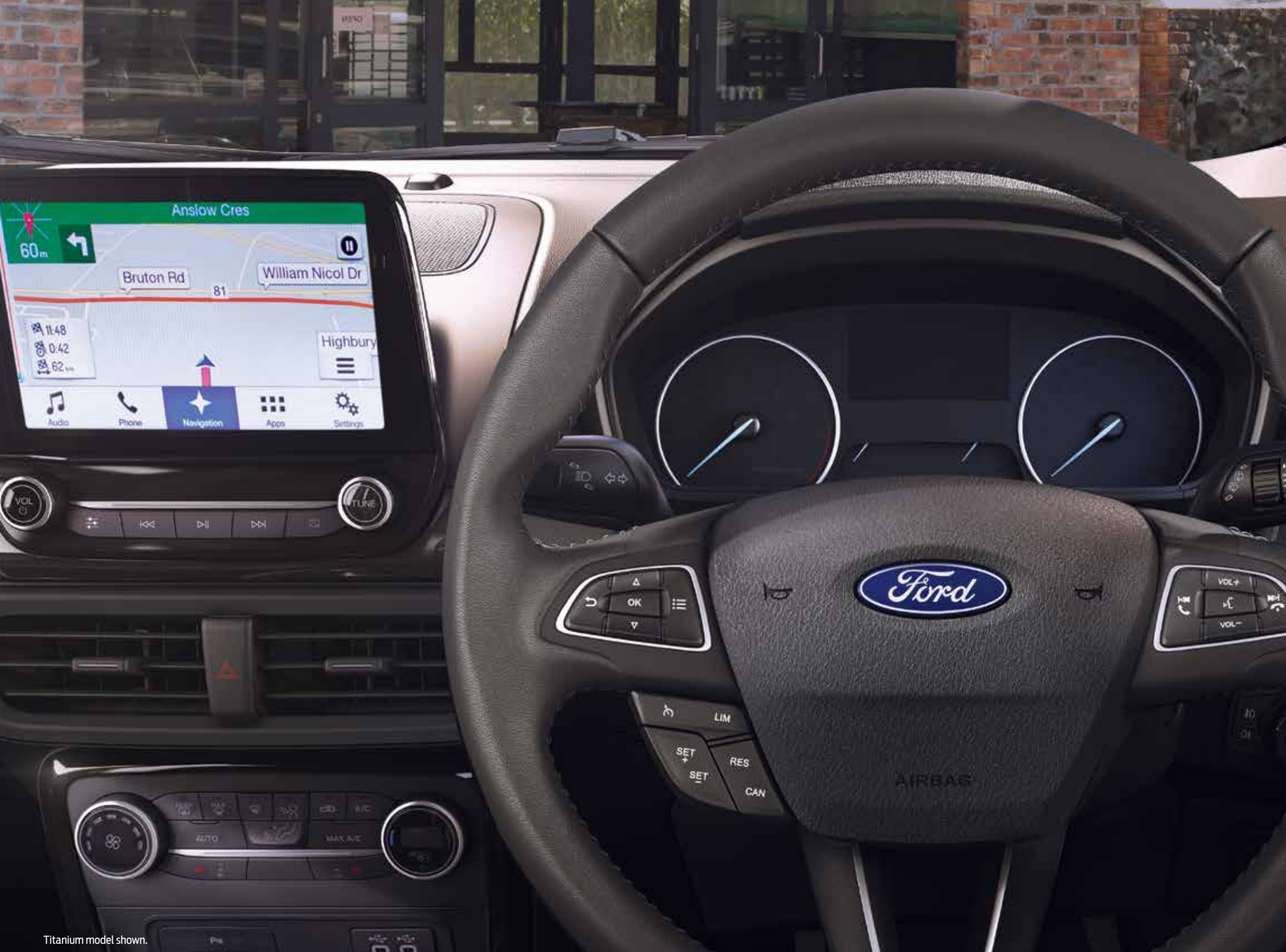
Titanium model shown.