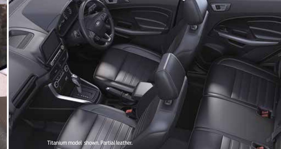
Titanium model shown. Partial leather.