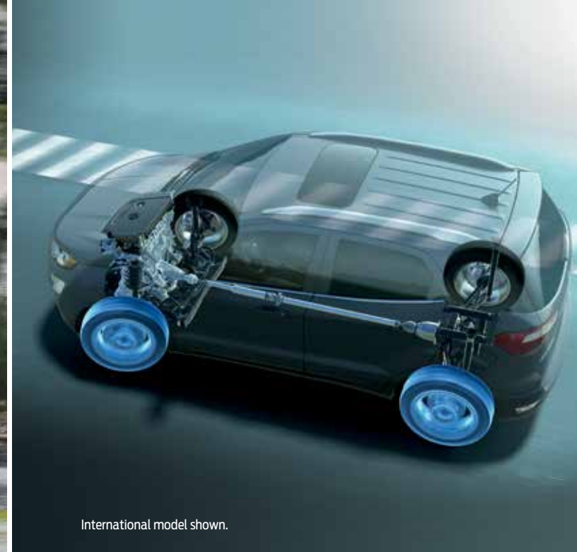
International model shown.