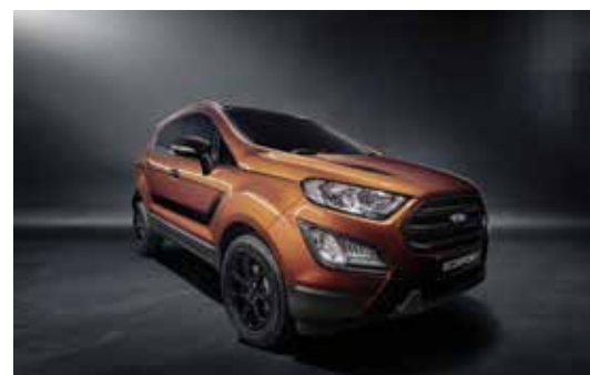
Black skid plate inserts